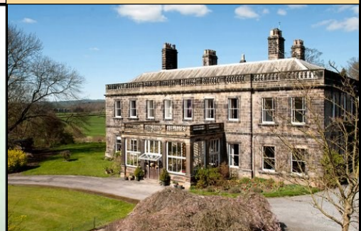
(Bottom Right): The current south façade of Arthington Hall