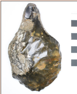
(Above): A Palaeolithic hand axe found in 1889 near Stanley (now held by Wakefield Museum)

Over the last few months we have been busy examining the records of antiquarian flint collectors (held in various local museums) and comparing this data with the records we already have in our HER database. This has meant a lot of enhancing existing database entries, as well as creating new records for previously unrecorded sites.