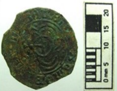
(Left): The 16th-century 'jetton' which was dated to 1553-84 AD by archaeologists

The motif is inspired by the famous prehistoric rock carvings that still survive all across the moors around Bradford.